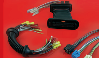
Harness repair sets