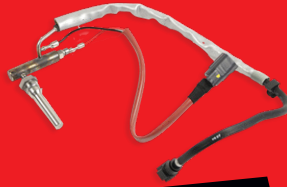
Injection Unit, soot/ particulate filter regeneration