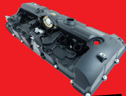
Cylinder head cover