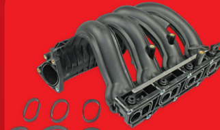
Intake manifold modules