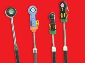
Cable, manual transmission