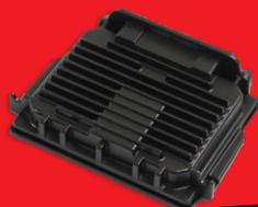
Xenon control unit