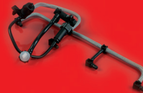
Hose, fuel overflow