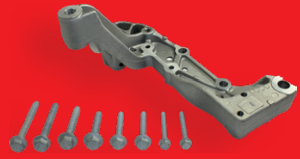
Stub Axle, wheel suspension