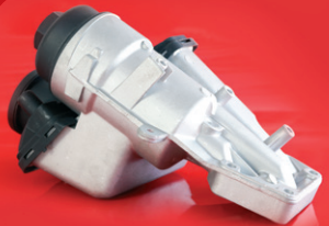
Housing, oil filter